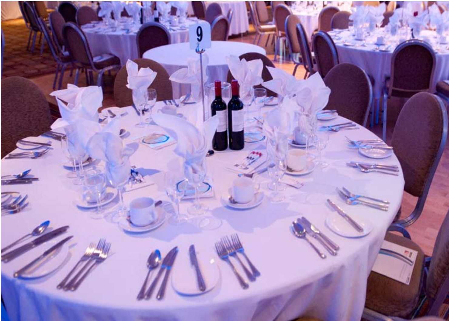
Table d'Hôte Menu